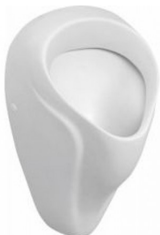
SLP 18 - NOVA PRO ALEX