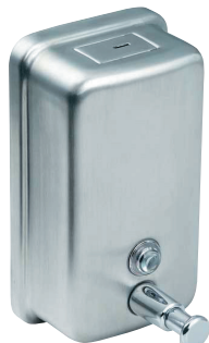
SLZN 05 95050 Stainless steel liquid soap dispenser