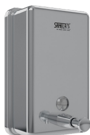
SLZN 39A 95391 Stainless steel liquid soap dispenser