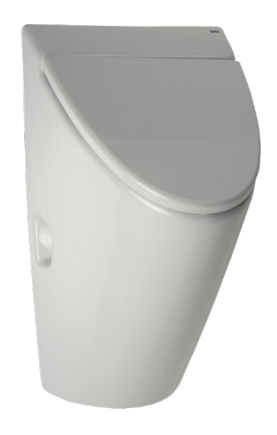
SLP 32 - ARQ WITH A COVER