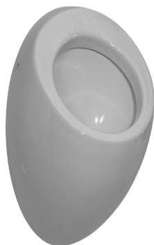
SLP 25 - ALESSI WITHOUT A COVER