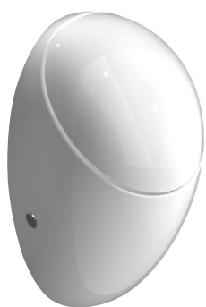
SLP 24 - ALESSI WITH A COVER